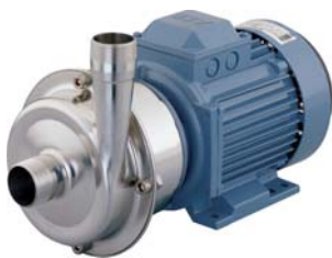
Estampinox EFI centrifugal pump