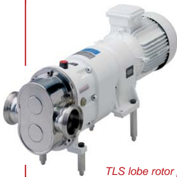
TLS lobe rotor pump

The main component of this skid is a hydrophobic membrane which contains small pores that allow gaseous molecules to pass. Only gases with low molecular weight can pass through the barrier thus the structural properties of the wine remain unchanged avoiding the loss of aromatic components. The wine flows at the outer shell side of hollow fiber membranes where as in the lumen side, a vacuum or CO 2 as a sweep gas, is applied for removal. To directly dissolve gas into the wine CO 2 flows with an overpressure of 0.2 – 0.5 bar and if desired can be added up to the limit of solubility. For alcohol removal, the circuit of water flows in the lumen side of the membrane thus due to the differential concentration of the alcohol in the wine, alcohol passes at the shell through the membrane into the strip water. This operation is less efficient than gas management because of a lower flux rate of the alcohol.